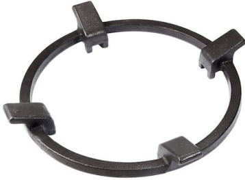
Cast iron wok support 9601 727