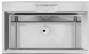
Sink FL 2975 060